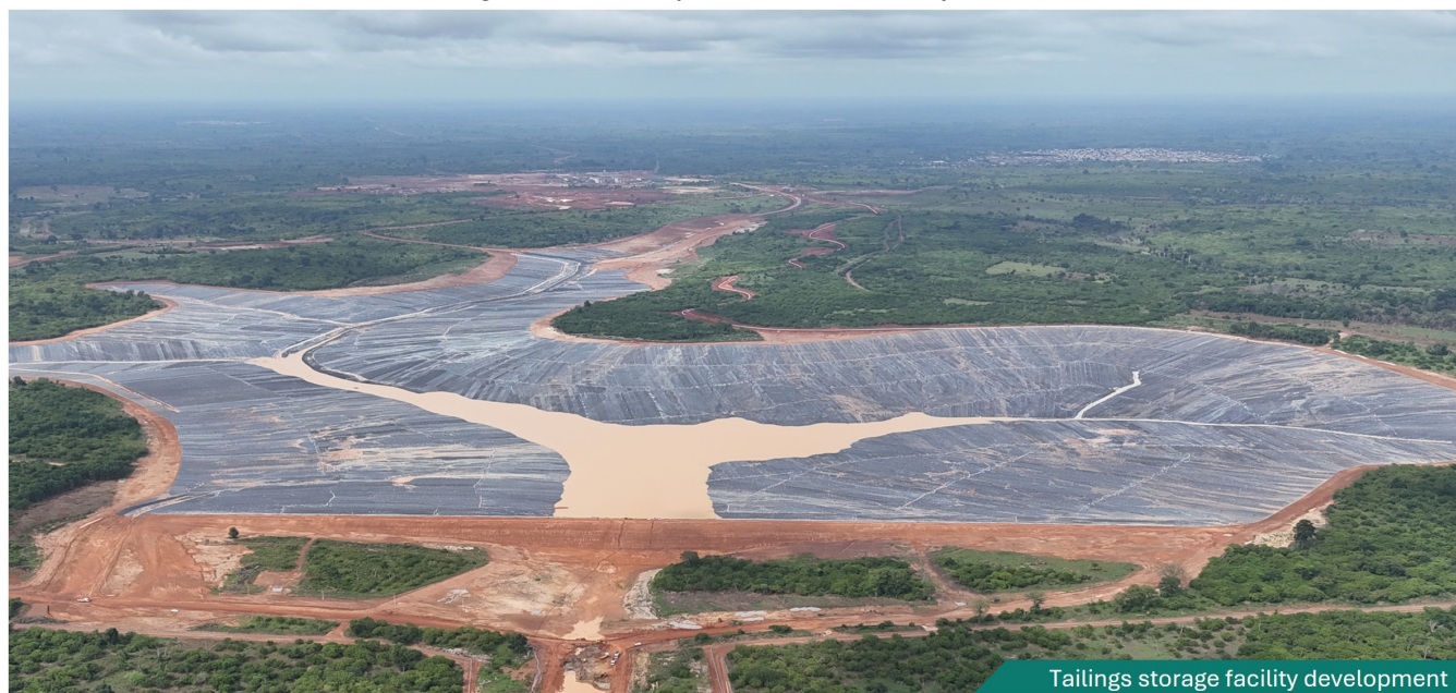
Figure 8: TSF development and HDPE liner laydown