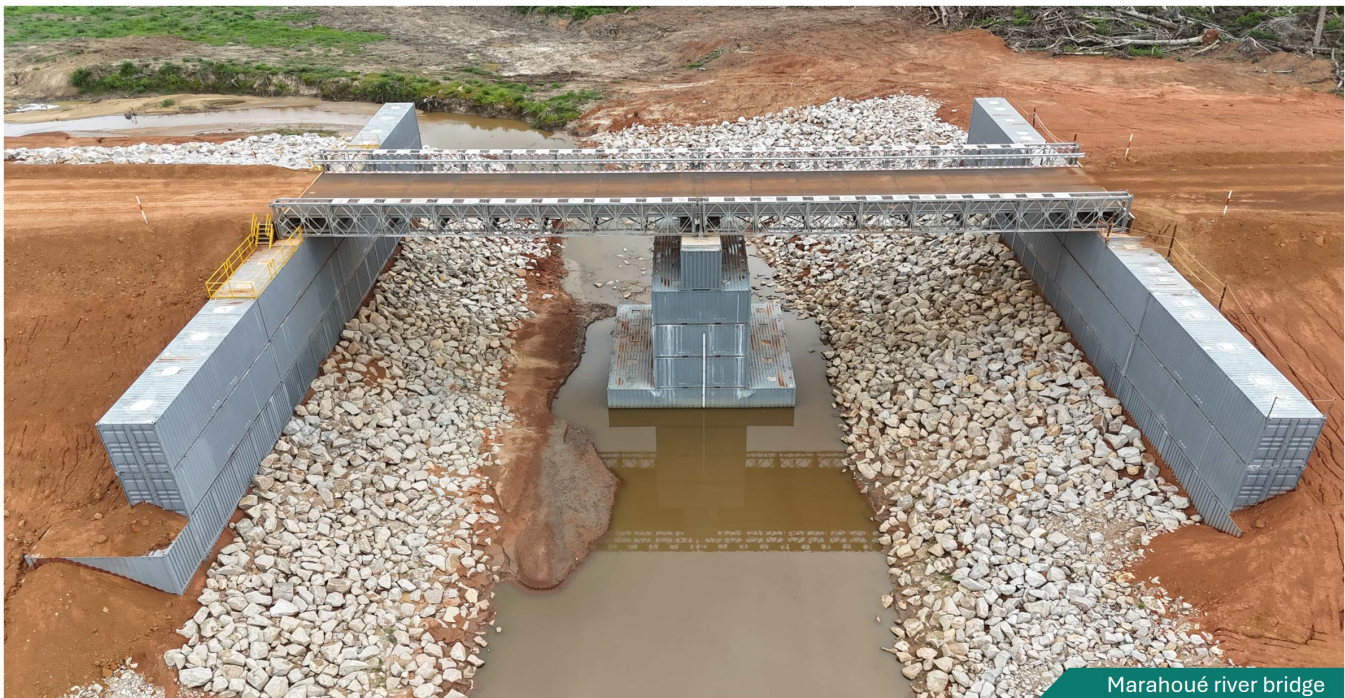
Marahoué river bridge