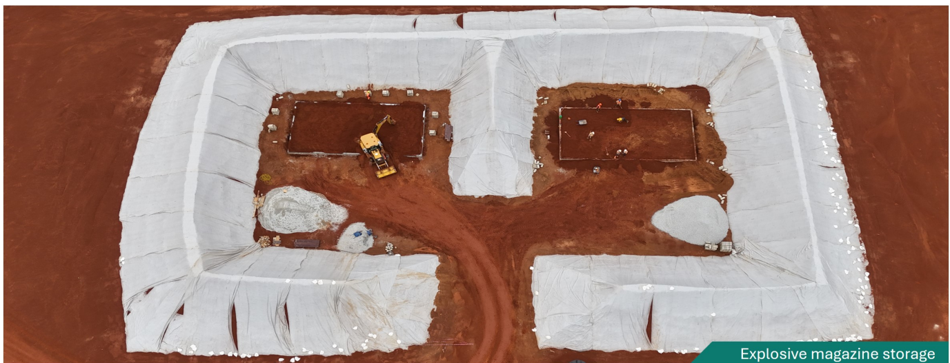
Figure 5: Explosive magazine earthworks at Koné