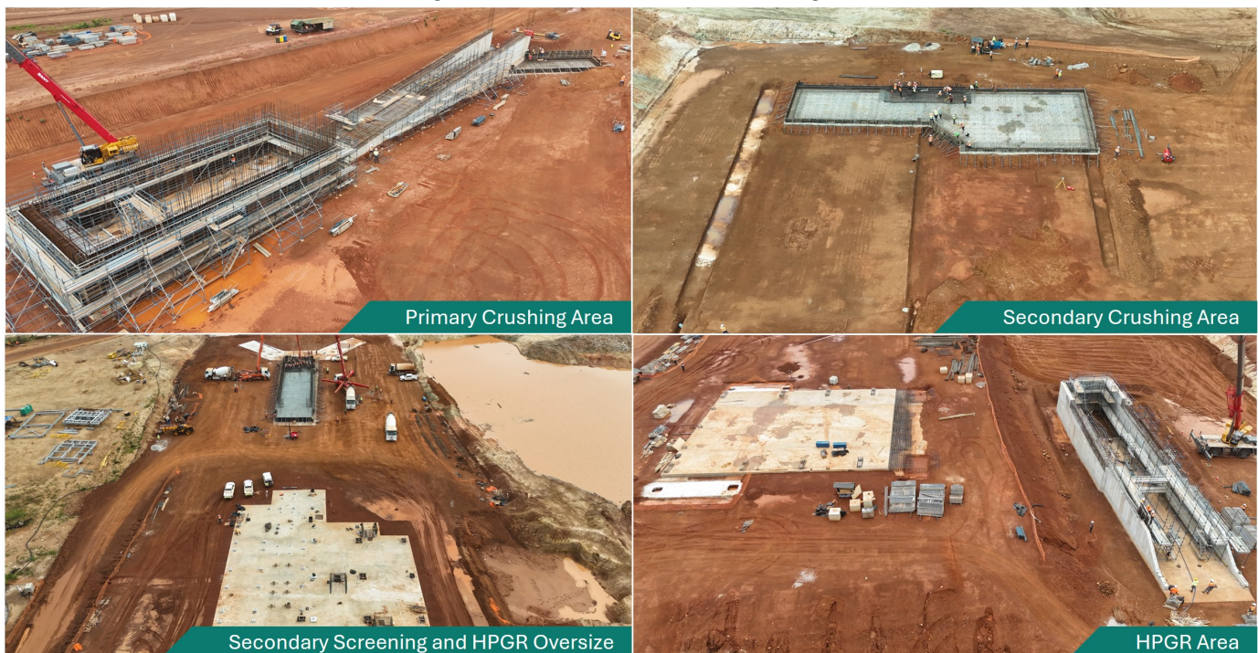
Figure 3: Hard-rock comminution circuit stages