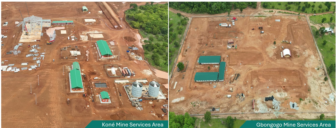
Figure 4: Koné and Gbongogo mine services areas